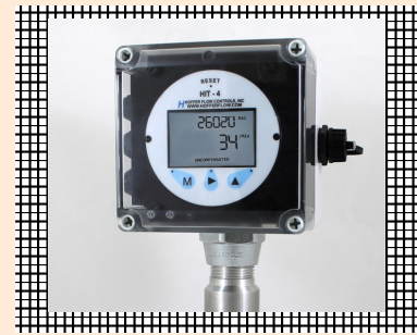
HIT-4U Rate Indicator / Totalizer (Refer to HIT-4U Technical Data Sheet)