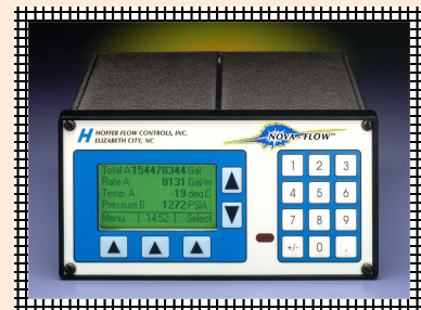
Nova-Flow Computer (Refer to Nova Flow Technical Data Sheet)